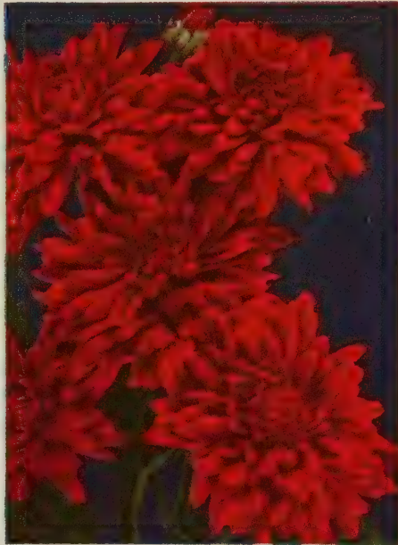
JUBILEE. 75c each; 3 for $2.00